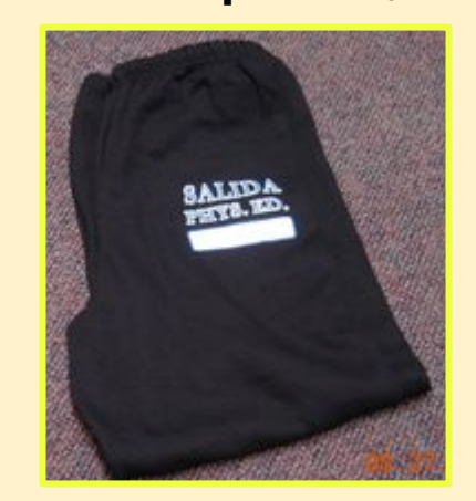
PE Sweatpants $17