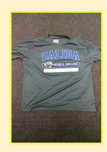
PE Dri-Fit Shirt $13