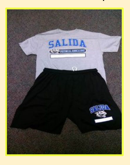
PE Shorts $13